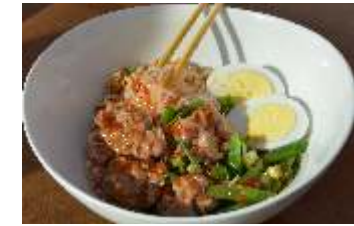
SPICY LIME NOODLE