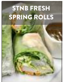
STNB FRESH SPRING ROLLS