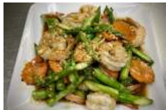
ASPARAGUS W/ GARLIC