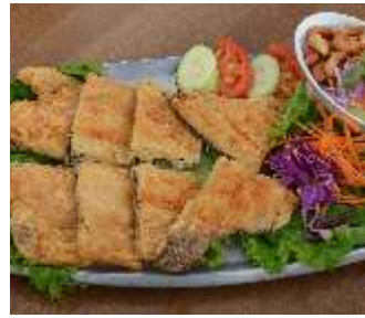
TROUT W/ APPLE RELISH