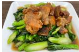
CHINESE BROCCOLI & CRISPY PORK