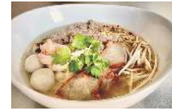
TOM YUM NOODLE SOUP