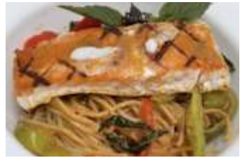
PANANG CURRY PASTA