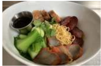
EGG NOODLE CHAPO