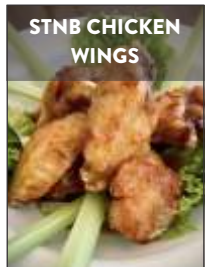
STNB CHICKEN WINGS