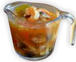
TOM YUM SHRIMP